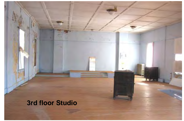
3rd floor Studio

Third floor Studio now cleared, office space cleared, above. Stairwell, new door, with restored arched light, under construction below.