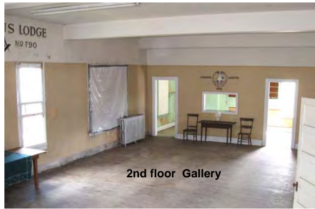
2nd floor Gallery