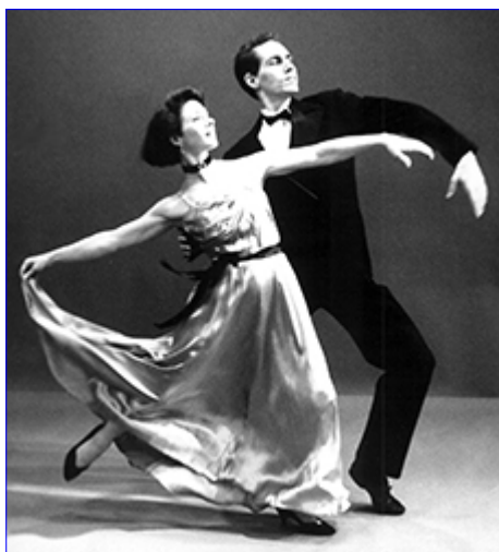
Waltz your nights away at Tahawus